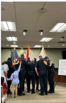
Temple Terrace 1st Runner-Up